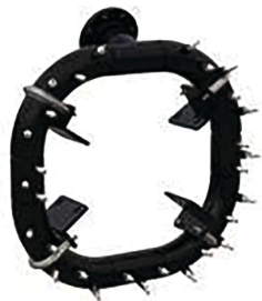
WATER JETTING RING

Enhance your pumping and dredging abilities with our premium add-ons. Our specialized equipment is designed to optimize your project by increasing solids production of your pump. Attachable add-ons are easy to install as the need arises. Contact us today to learn about the best add-ons available for your project.